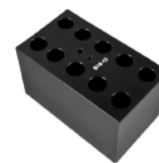
B10-13 BS-010418-LK block

23 sockets for 1.5 ml microtest tubes depth 35 mm