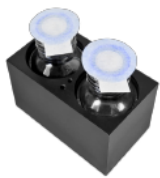
B2-50 BS-010418-AK block