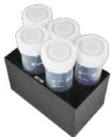
B5-29 BS-010418-KK block

Ø13 mm x 10 sockets, flat bottom, depth 30 mm