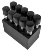
B10-16 BS-010418-BK block