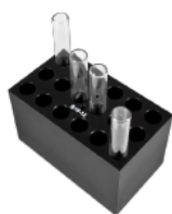
B18-12 BS-010418-EK block

Ø29 mm x 5 sockets, flat bottom, depth 40 mm