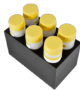
B6-25 BS-010418-CK block